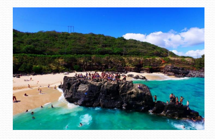
Swimming at Waimea Bay