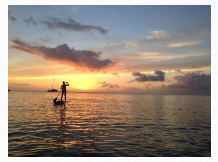
Stand Up Paddle Boarding