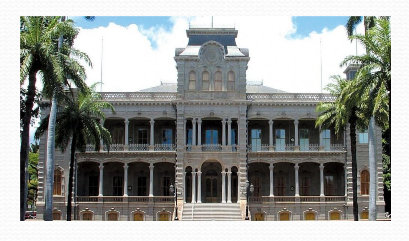
Exploring Honolulu and China Town (on your own)