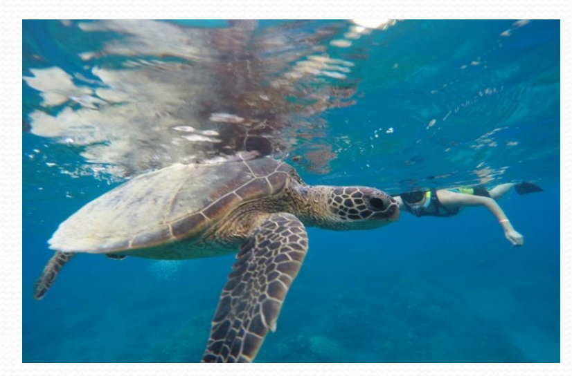
Swim with Sea Turtles