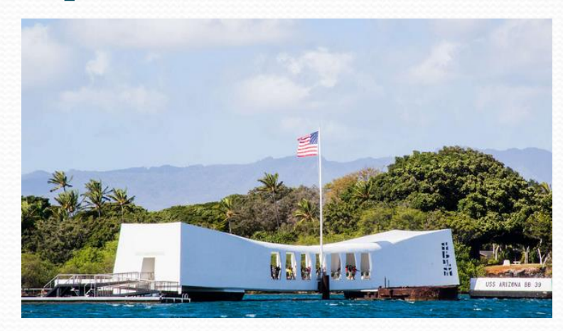
Pearl Harbor Tour