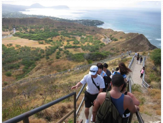
Visiting Diamond Head (self drive)