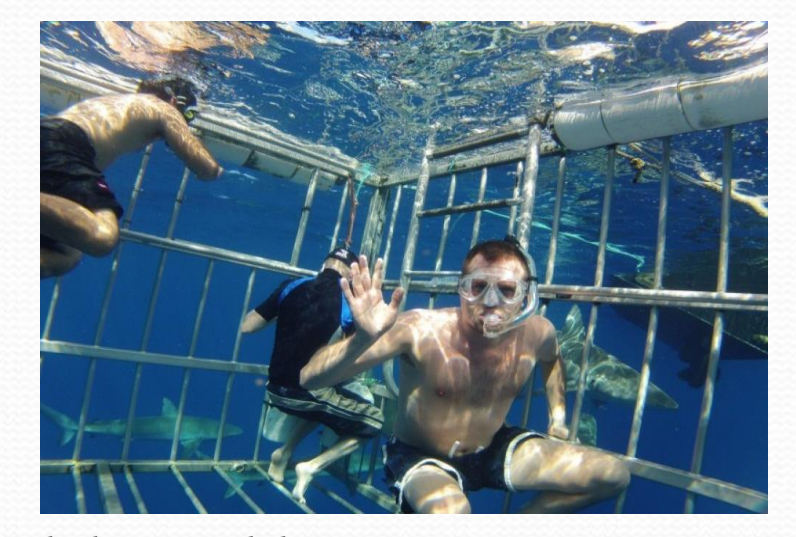
Shark Cage Snorkel Adventure