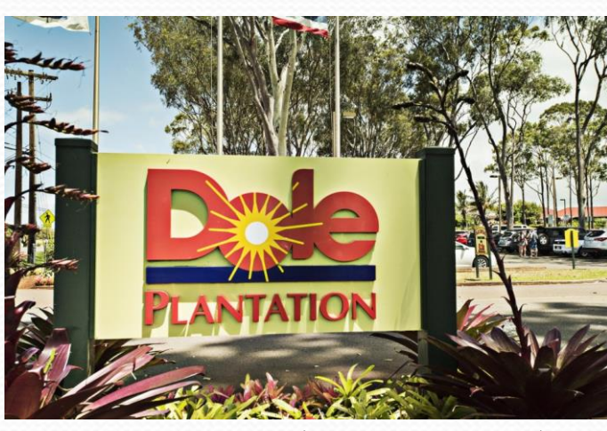
Dole Plantation (self drive or Guided)