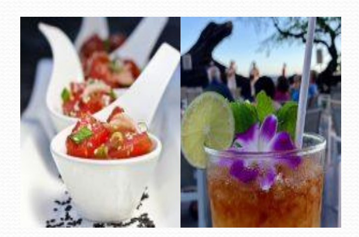
Food Tours and more