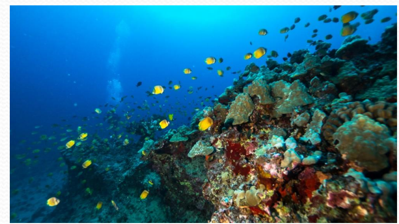
Wreck and Reef Diving Tour