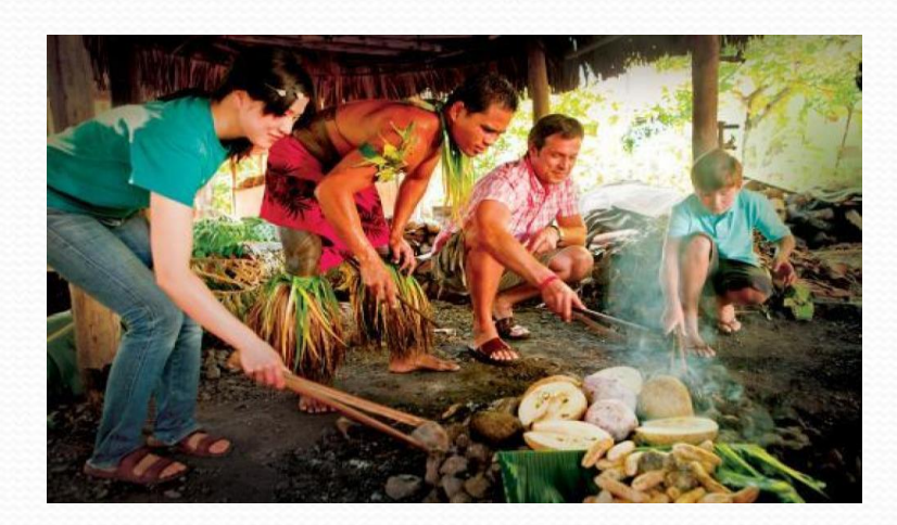
Polynesian Cultural Center