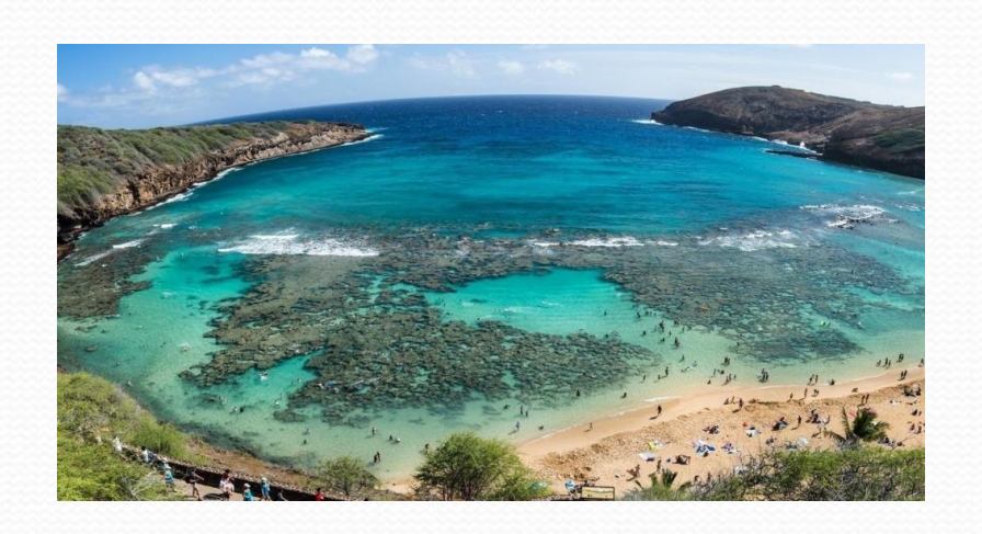
Snorkeling at Hanauma Bay