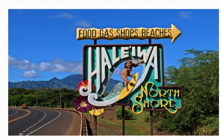
North Shore self drive or Jeep tour)